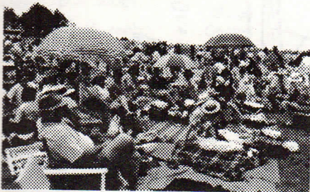
The "Crew" at the Pokolbin Jazz and Wine Festival

About 20 members attended the annual weekend gathering at Ford Drive Country Club, Lake Eildon in March. Like Hervey Bay, we also have a few members (5) who live about 200 km away.